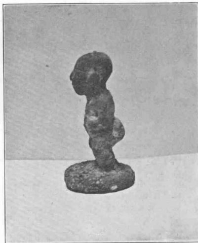
FIG. 230. METAL SEAL, WITH GROTESQUE FIGURE OF A BOY. [HEIGHT 1\frac{1}{2} INS.]