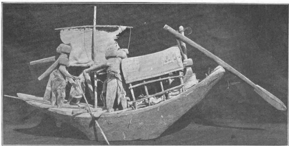
FIG. 229.—MODEL OF SAILING BOAT, WITH CANOPY. TOMB 575.